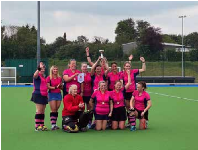
West Meon Ladies hockey team

Thanks to grants from Winchester District and West Meon Parish Councils, the heating in the upstairs function room in the pavilion has been upgraded. The energy efficient, silent, infra-red panels will lower the heating costs and improve the thermal comfort for those using