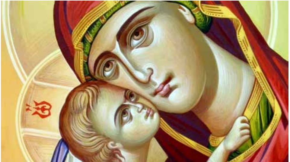
12th Century Byzantine icon known as the Theotokos of Vladimir

Mary, the sister of Martha and Lazarus, was a friend and companion of Jesus. We remember all three together in the church each year at the end of July. In Luke’s Gospel, we read about